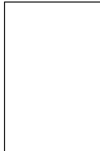
Full Page 7" x 10" $375